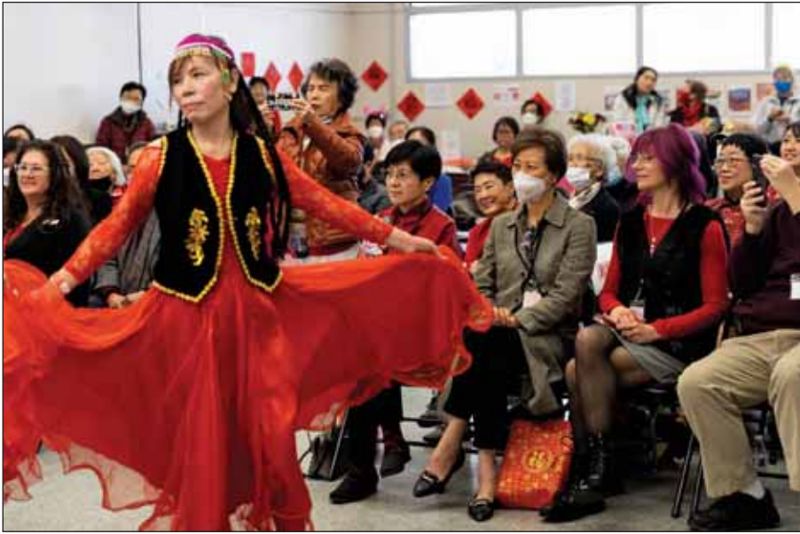
Attendees watch and record a dance performance at the Lunar New Year celebration hosted by Avenidas Chinese Community Center at Cubberley Community Center.

Providing a space for the area's aging Asian population to connect with others who share a similar heritage was one reason that Avenidas launched the center in 2018. In Palo Alto, 15% of the aging population currently identifies as Asian, and in neighboring Mountain View, Asians represent over 20% of the senior population, according to data from Avenidas.