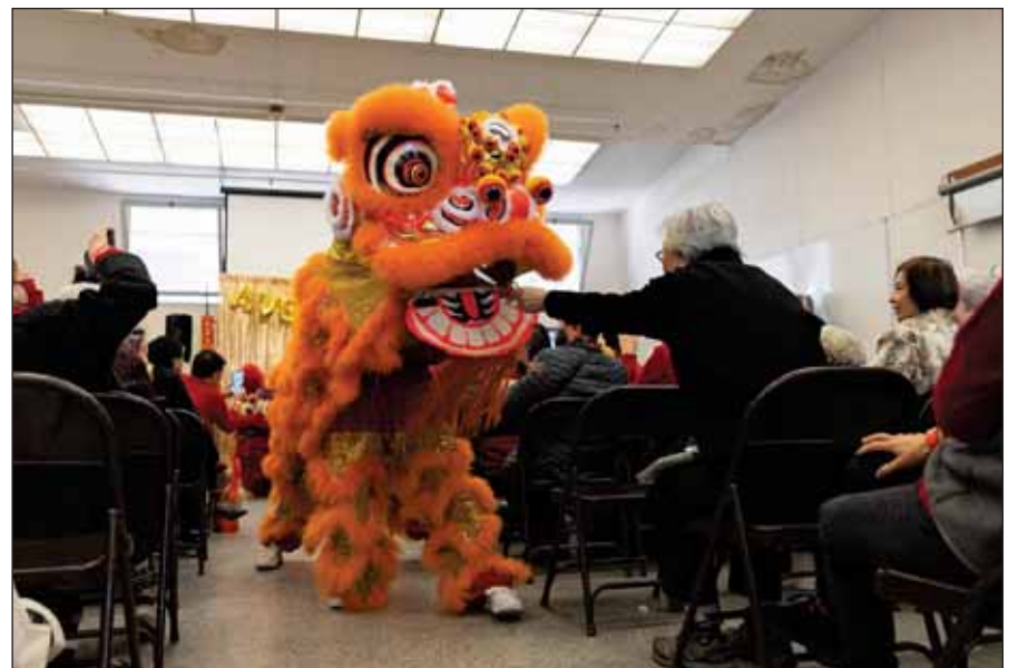
Above: A lion is fed a red envelope during a performance at the Lunar New Year celebration hosted by Avenidas Chinese Community Center in Palo Alto on Jan. 26. Top: People dance to “Gong Xi Gong Xi,” which translates to “Congratulations, Congratulations,” during the celebration.

She not only takes the painting class, but she’s enrolled in an “Everyday Cantonese” course, as well as a baduanjin exercise class at the center.