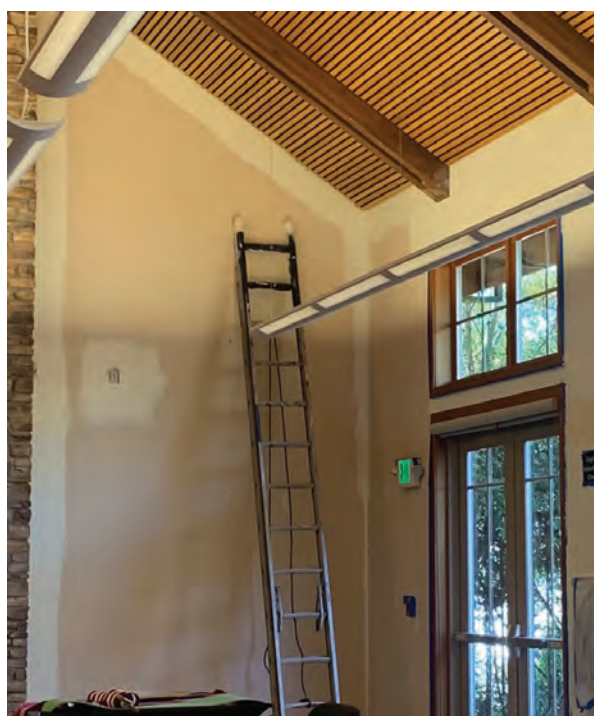
The Avenidas Rose Kleiner Center got new paint, flooring, and a brand new HVAC system to prepare for participants to return to the center.