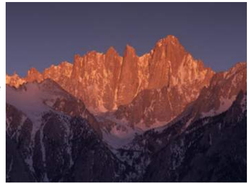
Sunrise on Mount Whitney-The End of the John Muir Trail