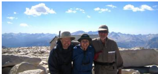
On top of the world after 23 days—Mount Whitney